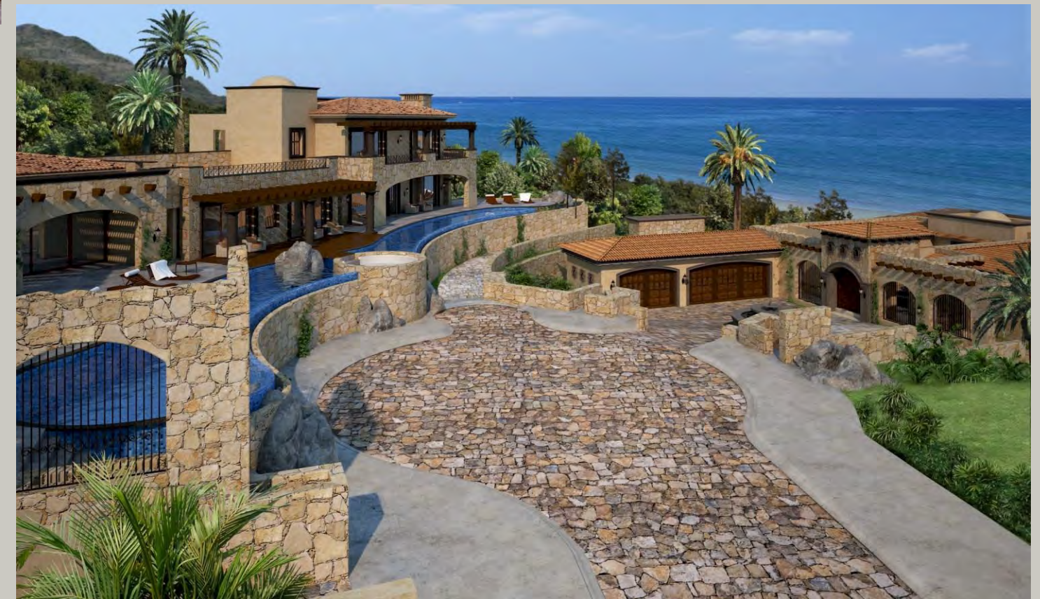
COVE L 5 , PALMILLA San José del Cabo, B.C.S . México