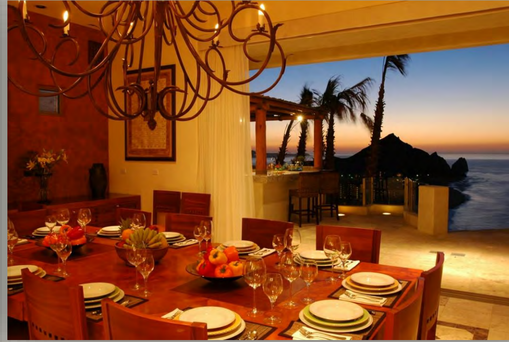
VILLA PEÑASCO, EL PEDREGAL Cabo San Lucas, B.C.S . México