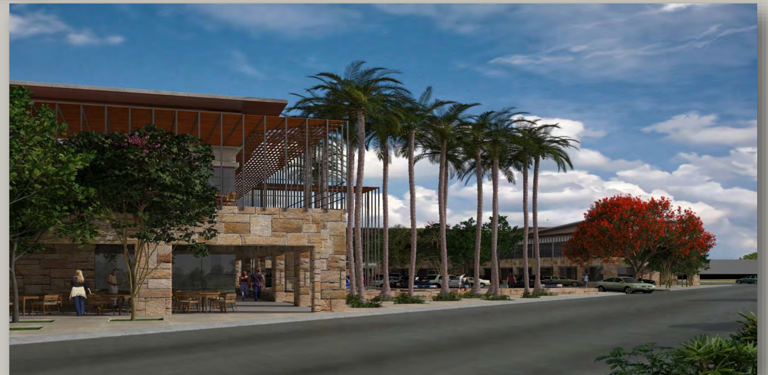
PLAZA NOVVA, EL TEZAL Cabo San Lucas, B.C.S . México