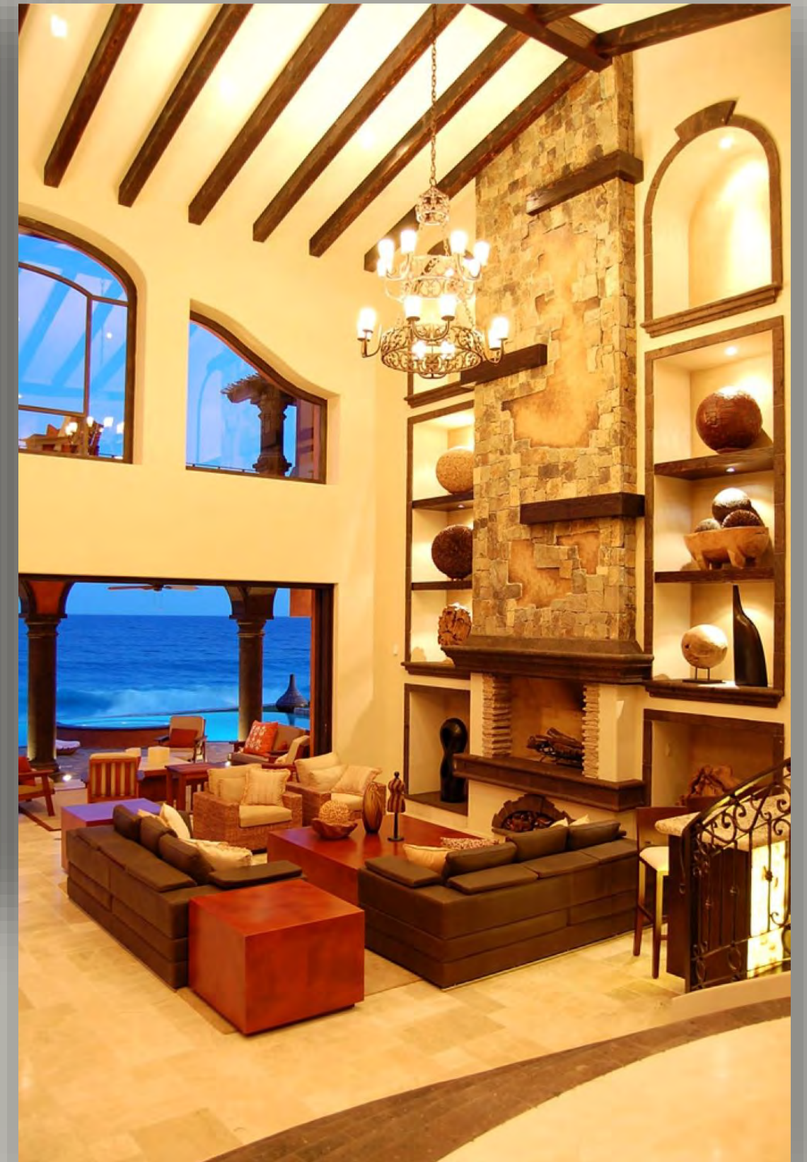
VILLA ALEXA, EL DORADO L 125 San José del Cabo, B.C.S. México