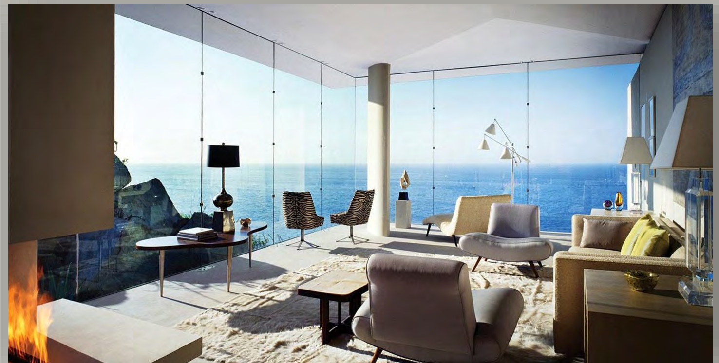
CASA FINISTERRA, EL PEDREGAL Cabo San Lucas, B.C.S . México