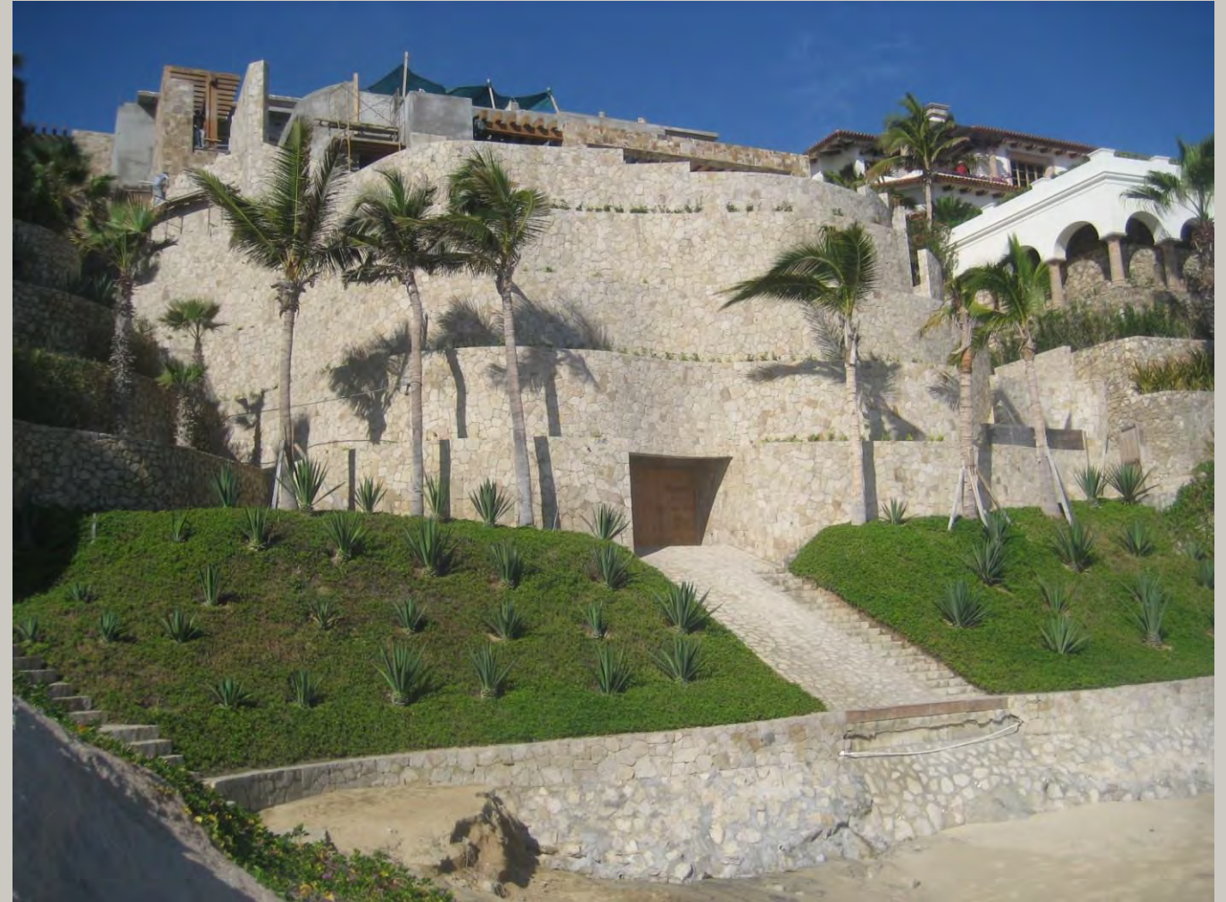
CALETA L 58, PALMILLA San José del Cabo, B.C.S . México