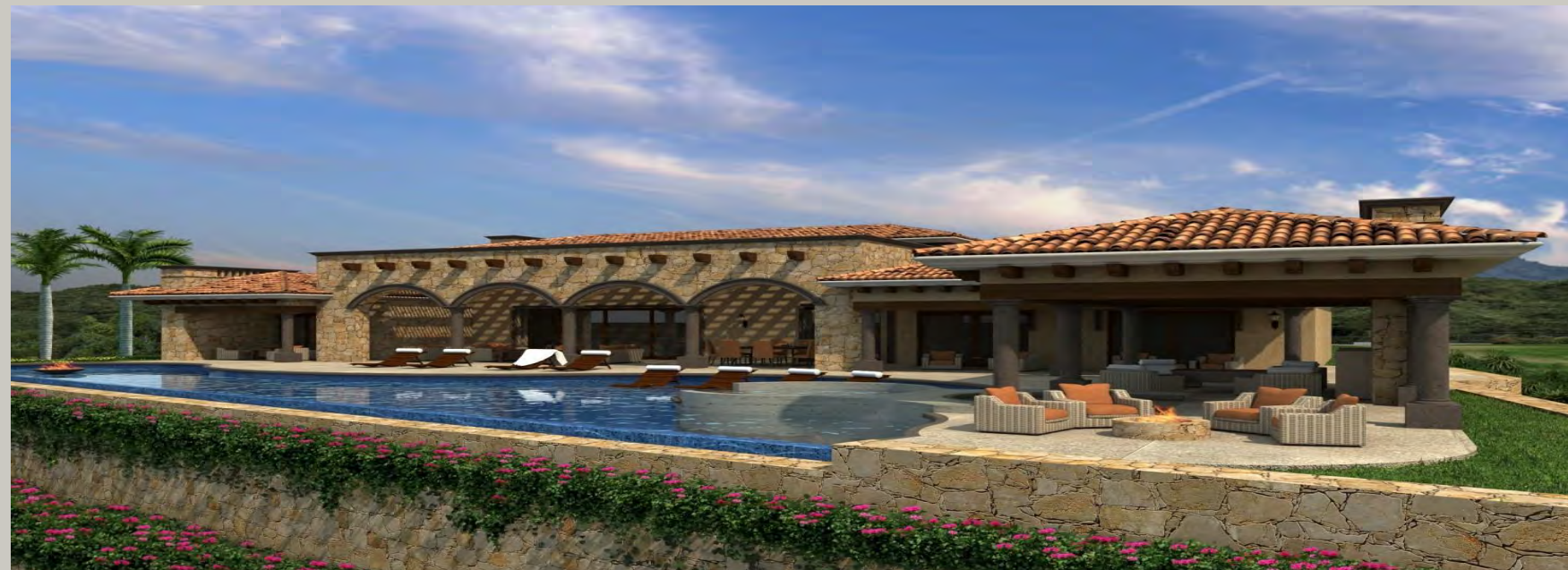
THE COVE L 1 , PALMILLA San José del Cabo, B.C.S . México