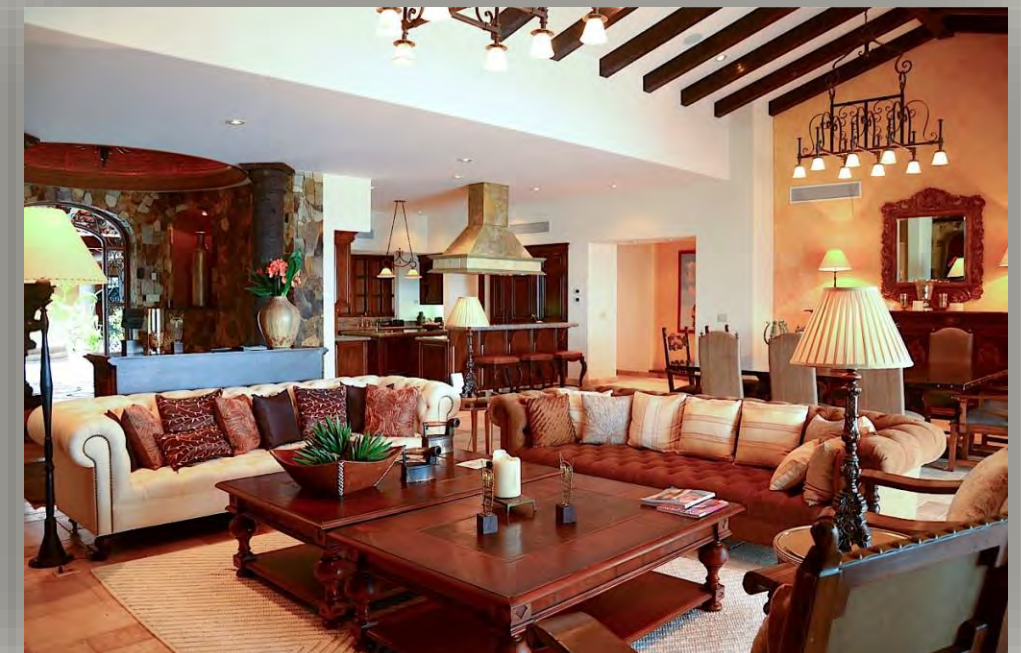
VILLA BELLA, FUNDADORES PLC L 21 San José del Cabo, B.C.S . México