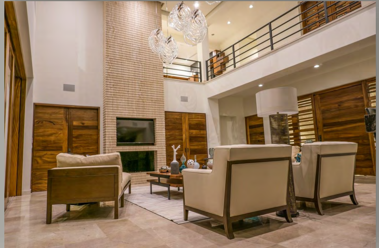
EL DORADO L 230 San José del Cabo, B.C.S. México