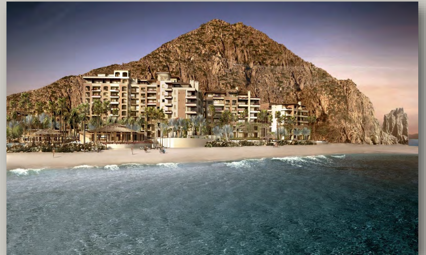
HOTEL GRAND SOL MAR Cabo San Lucas, B.C.S . México