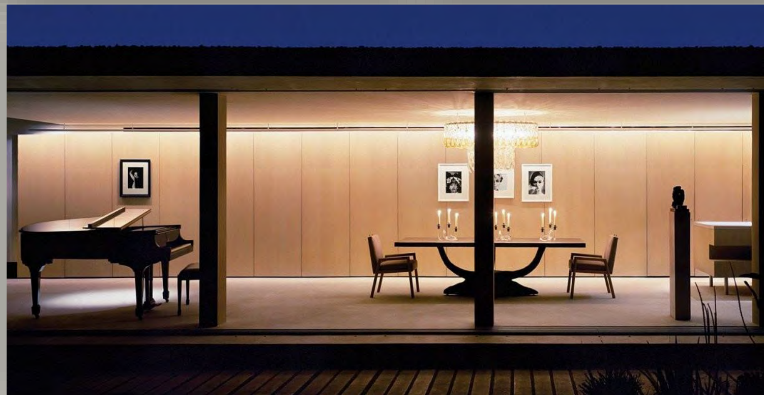
CASA FINISTERRA, EL PEDREGAL Cabo San Lucas, B.C.S . México