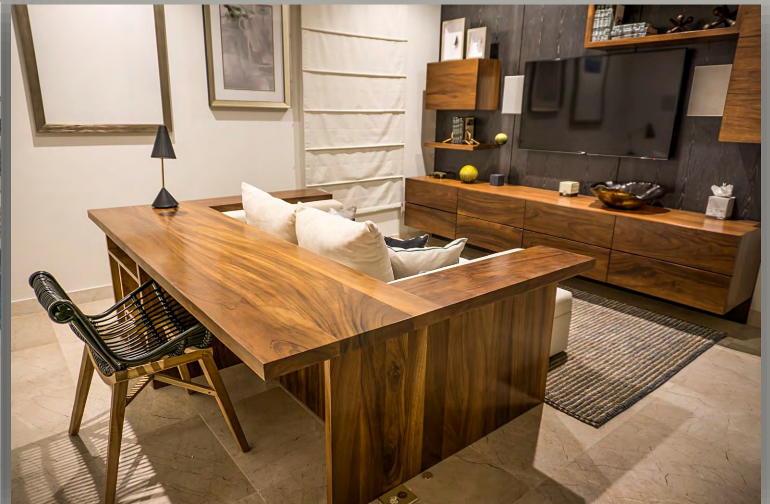
EL DORADO L 230 San José del Cabo, B.C.S. México